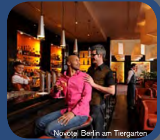
Novotel Berlin am Tiergarten

Straße des 17 Juni 106-108 · 10623 Berlin Tel.: (+49)30/600350 · Fax: (+49)30/60035666 E-Mail: h3649@accor.com